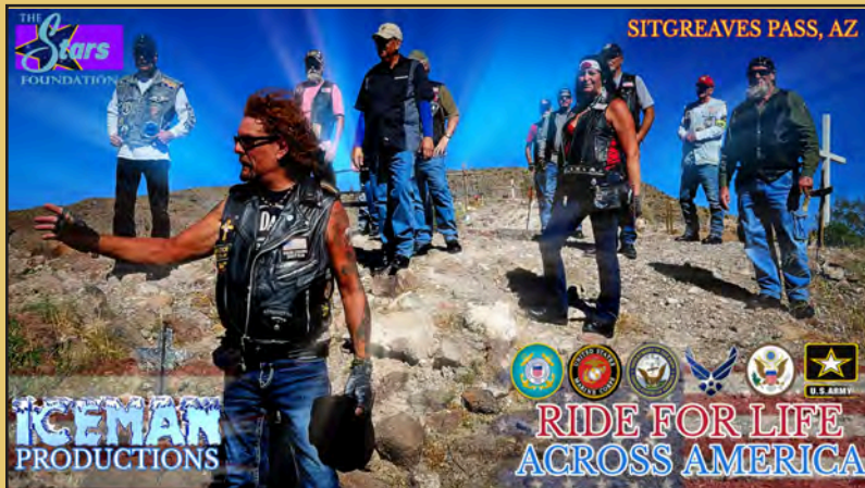
Mass Burial for our Fallen Heroes - Ride for Life - National Suicide Awareness Campaign