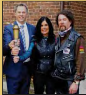
Lt. Gov Dan Forest, NC