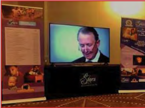
Lord David Alton, UK Parliament-Life Peer

Episode content is spawned from distinguished public figures through strong testimonials who share how they are using 'Love in Action' deeds to bring about solutions to the plights associated with the displaced and oppressed children of the world.