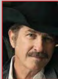
Kix Brooks Country Artist