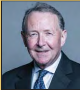
Lord David Alton

People with Hearts on Fire to make a Difference in the World