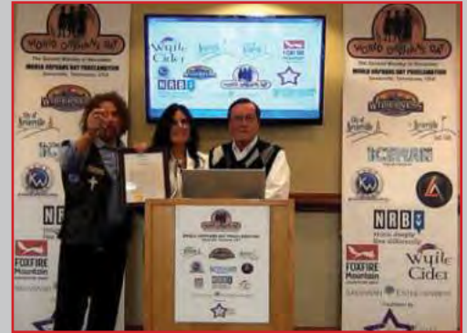
World Orphans Day, Sevierville, TN

Episode content is spawned from distinguished public figures through strong testimonials who share how they are using 'Love in Action' deeds to bring about solutions to the plights associated with the displaced and oppressed children of the world.