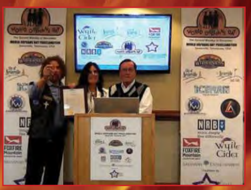
World Orphans Day, Sevierville, TN

Episode content is spawned from distinguished public figures through strong testimonials who share how they are using 'Love in Action' deeds to bring about solutions to the plights associated with the displaced and oppressed children of the world.