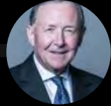
Lord David Alton Life Peer UK Parliament