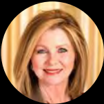
Marsha Blackburn Senator, Tennessee, USA