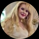
Rebecca Holden Hollywood Actress