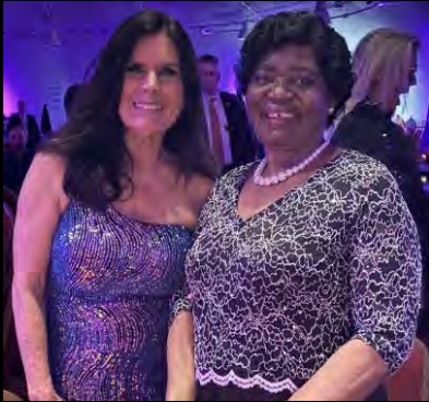
Cheryl Piggott & First Lady Monica Chakwera – Malawi.

National Filming Campaign Now Complete - 26 Episodes