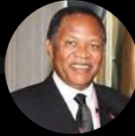
Themba Masuku Prime Minister, Eswatini