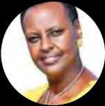
Janet Museveni First Lady, Uganda