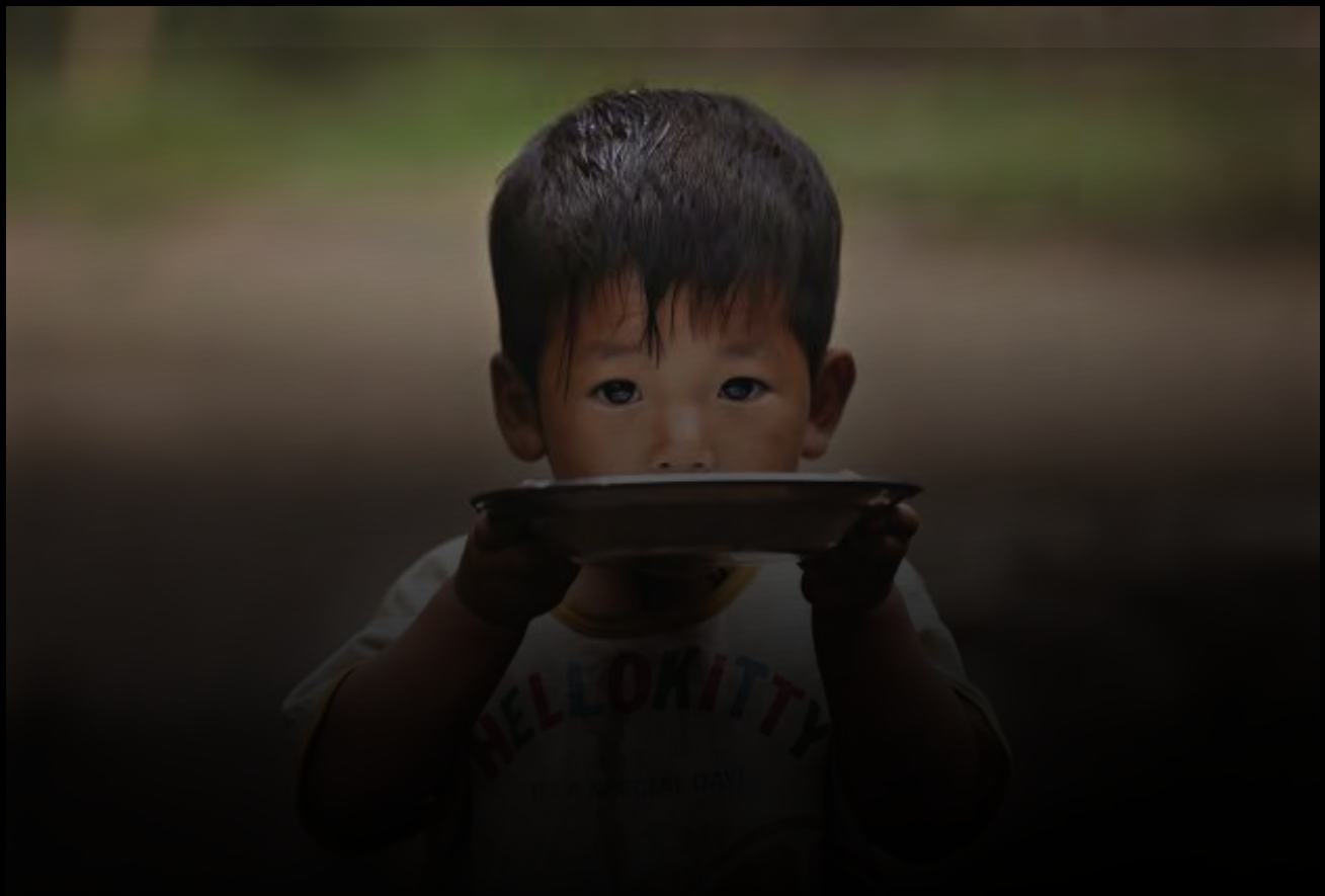
International Media Campaign(s) - Photo for The Stars Foundation

To help facilitate the alleviation of poverty and hunger, working with the international NGO's, and to advocate for the UN Sustainable Goals #1: No Poverty, Goal #2: No Hunger Goal #3: Health and Wellness, Goal #4: Education and Goal #16: Peace and Justice.