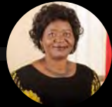
Monica Chakwera First Lady, Malawi