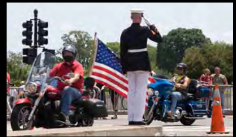
Laughlin, NV - Veteran Day and Military Advocacy