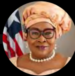
Kartumu Yarta Boakai First Lady, Liberia