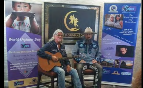
1st Ladies Summit for Vulnerable Children – Nashville, TN