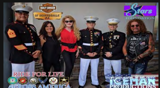
Patriot Nation's Suicide Prevention Ride across 9 USA States Coast-to-Coast Carrying ashes of 3 Armed Forces Personnel who succumbed to suicide and were buried at Sitgreaves Pass, AZ

PATRIOT NATION RIDE for LIFE conveyed a strong message of hope to the veterans and other marginalized people who suffer with mental illness, PTSD, and thoughts of Suicide. These television special will highlight the current pandemic of SUICIDE among Veterans, First Responders, Teens, Homeless, Native Americans, and Addicts.