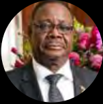
Dr. Peter Mutharika President, Malawi