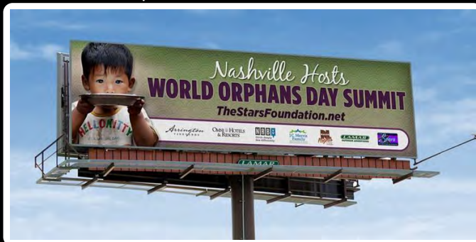
National Highway Billboard Campaign welcoming a Prime Minister, 3 First Ladies and many Dignitaries to Nashville

The Flame of Peace Tour visits with heads of state and First Ladies providing a platform on the world stage for Musical performances and Crusades. It's through our donor support we can film the plight of the under served orphanages, feeding and medical programs, and feature our 'Love in Action Deeds' to a worldwide television audience as seen in 83 countries and 273 million households globally per each episode airing. The mandate is to help distribute medical services, supplies and aid for our charitable partners in those countries and domestically.