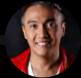
Arnel Pineda Journey