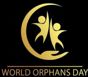
Click for PSA