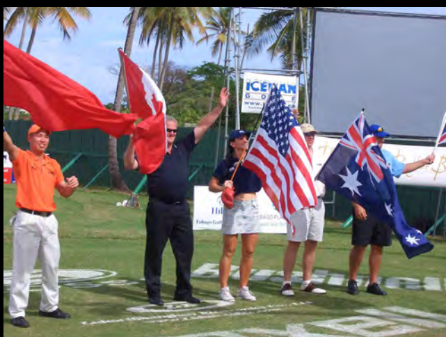
International Long Drive Championship Series