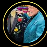
Manuel Cuevas Fashion Designer