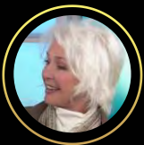
Jennifer O'Neil Hollywood Actress