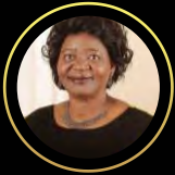
1st Lady Monica Chakwera Malawi

FUNDRAISER FOR ORPHANS & VULNERABLE CHILDREN