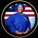
Dr. Jewel Howard Taylor Fmr 1st Lady Liberia