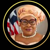
1st Lady Kartumu Boakai Liberia